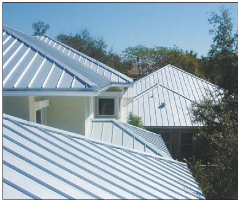
Most residential metal roofs in South Florida are made from either Galvalume or