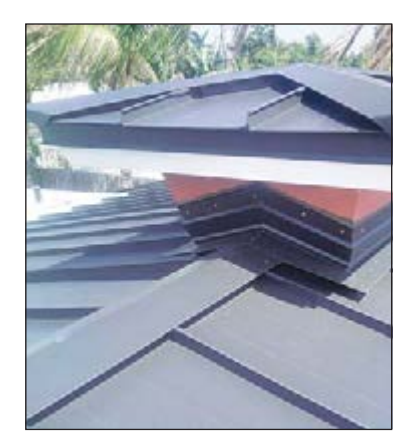
A metal roof is considered to be the strongest of the options, but it costs more than either shingles or tiles.

"Metal roofs last a lot longer than other kinds," says Fred Burgos, Broward manager of Evans Roofing in Oakland Park, estimating the lifespan for a shingle roof at 18 years, a tile roof at 25 to 30 years and a metal roof at 50 to 60 years.