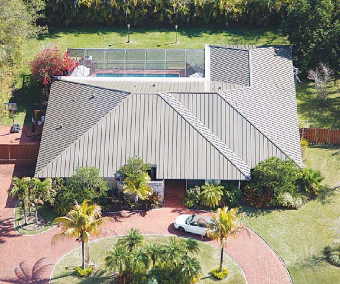
A metal roof may add to the resale value of a home.

The process of installing a metal roof involves first removing the old roofing, whether it is shingles or tile. Any damaged wood underneath will need to be replaced. Then the roofer will install two underlayments. Application of the metal follows the underlayments. "The process for installing a metal roof is more technical [than a shingle or tile roof], so be sure you have the right installer," Burgos says. "The cuts and corners of each piece have to be very accurate, and the overlays have to be very tight."